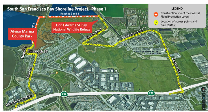
Areas of Construction and Haul Routes

Trucks entering the construction site from the Alviso Marina County Park will use State Route 237 to Lafayette Street/ Great America Parkway to the Gold Street connector to Gold Street to Elizabeth Street. They will take Elizabeth Street to Hope Street and then use the eastern most county park maintenance access road. Trucks that enter the construction site from the USFWS Refuge Visitor Center will use State Route 237 to Zanker Road/Los Esteros Road to Grand Boulevard. Trucks will generally exit the same way they came in.