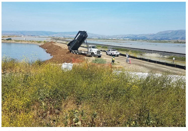
Soil was delivered to Pond A12 for use on future levee construction.